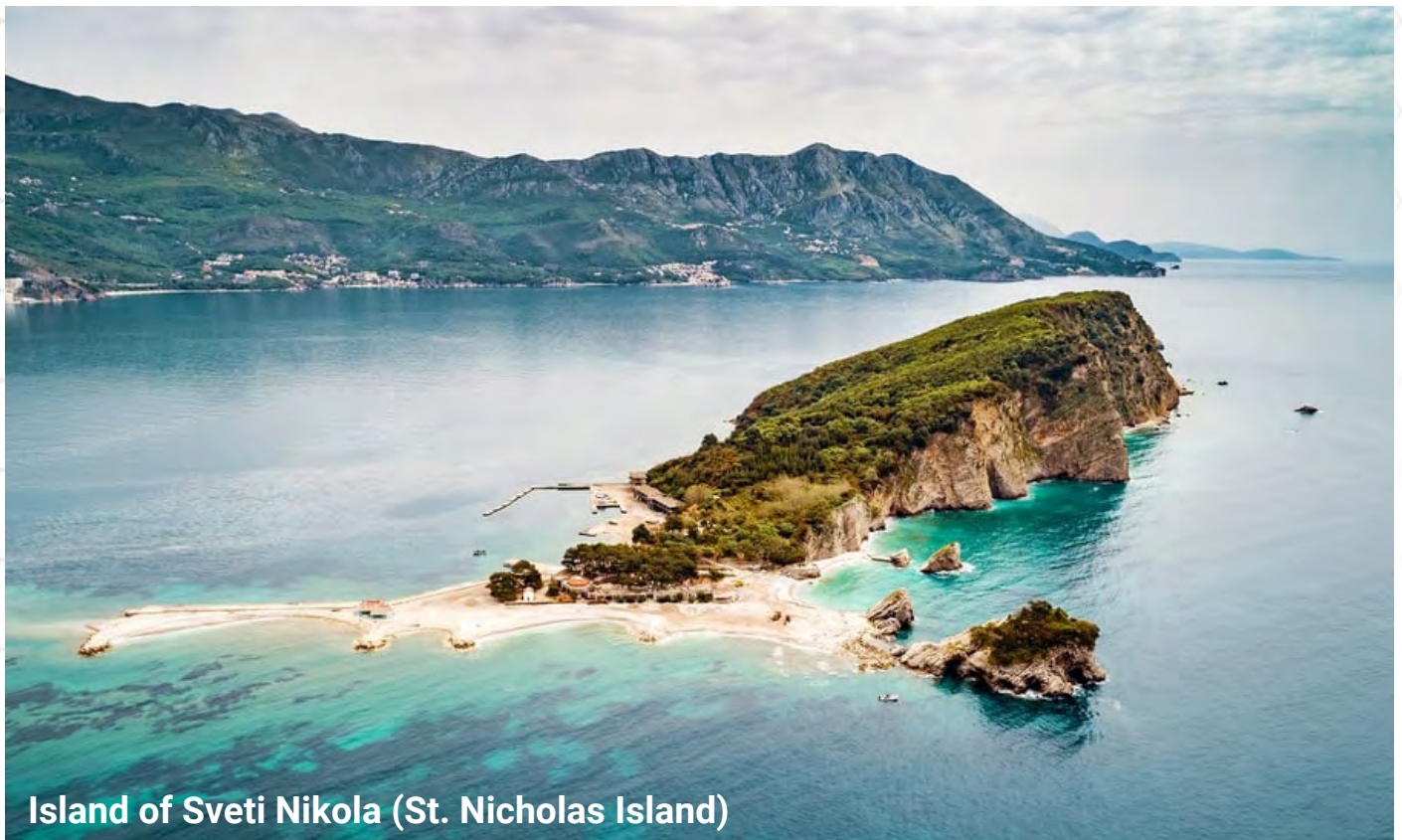
Island of Sveti Nikola (St. Nicholas Island)