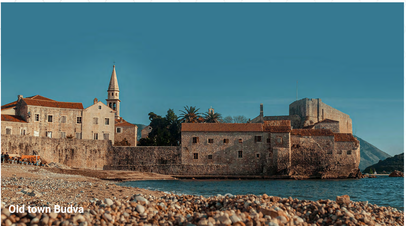
Old town Budva

For centuries, Budva was a thriving center of trade and culture, influenced by various civilizations including the Illyrians, Romans, Venetians, and Ottomans. Today, it is not only a cultural hub but also a modern destination known for its lively atmosphere, making it the ideal place to host international events like a karate competition.